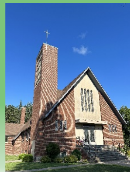
Saint Edward Saint Mary Saint Francis of Assisi