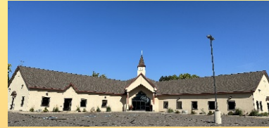
Saint Edward Saint Mary Saint Francis of Assisi