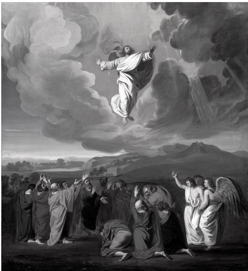
Jesus' ascension to Heaven depicted by John Singleton Copley in Ascension (1775)

Children's Liturgy 10:00 a.m. Mass at St. Mary's. Children's ministry will not meet Sunday, May 24th due to the Graduation Mass. We will meet for the last time on May 31st until resuming again in the fall.