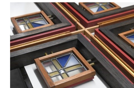
Jubilee Cross for the St. Cloud Diocese

Please join us on Sunday, Dec. 29th at the Cathedral of St. Mary, St. Cloud at 6:00 p.m. beginning in the lower level and processing by candlelight to the Jubilee Cross and then into church for Mass.