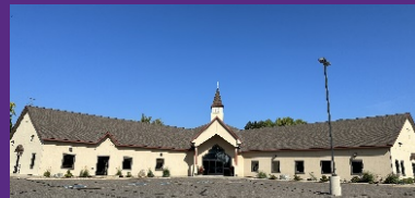
Saint Edward Saint Mary Saint Francis of Assisi