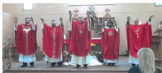
Powerful moment during Confirmation when the Bishop and priests prayed over the Confirmation students!

And lastly, I am discerning the scheduling of weekend Mass times beginning the first weekend of July. This has been the traditional time of the year in which our parishes would rotate Mass times. We know that the diocese asks that we have a permanent schedule. The real challenge for our three parishes is to ask one parish to have the Saturday Mass on a permanent basis. So as your Pastor, I plan to make the decision as to what I believe the Holy Spirit is wanting for our three parishes as well as our diocese. As I continue to discern and speak with other priests, please pray that God's will be done.