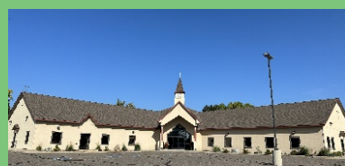
Saint Edward Saint Mary Saint Francis of Assisi