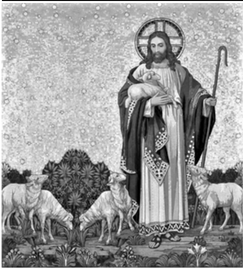
Jesus' heart was moved with pity for them because they were troubled and abandoned, like sheep with out a shepherd. ~Mt 9: 36

KC Float: July 5th Bowlus parade & August 8th, Upsala parade.