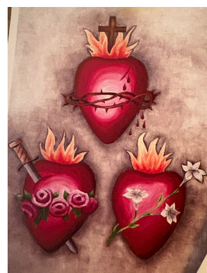
Sacred Heart of Jesus Immaculate Heart of Mary Most Chaste Heart of St. Joseph

This is not a new devotion. In the seventeenth century, St. John Eudes preached it together with that of the Sacred Heart; in the nineteenth century, Pius VII and Pius IX allowed several churches to celebrate a feast of the Pure Heart of Mary. Pius XII instituted today's feast of the Immaculate Heart of Mary for the whole Church, so as to obtain by her intercession "peace among nations, freedom for the Church, the conversion of sinners, the love of purity and the practice of virtue" (Decree of May 4, 1944). ~catholicculture.org