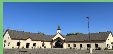
Saint Edward Saint Mary Saint Francis of Assisi