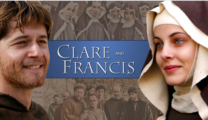
formed Forming Catholics for Life. Movie: Clare & Francis-watch on FORMED

Jesus said to his disciples: “The Advocate, the Holy Spirit, whom the Father will send in my name, will teach you everything and remind you of all that I told you. Peace I leave with you; my peace I give to you.” (Jn 14:26-27a)