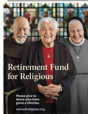
Retirement Fund for Religious