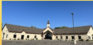
Saint Edward Saint Mary Saint Francis of Assisi