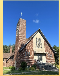
Saint Edward Saint Mary Saint Francis of Assisi