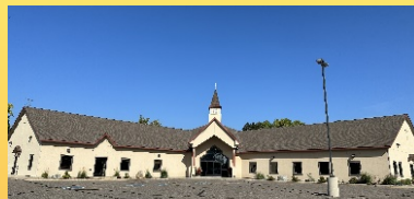
Saint Edward Saint Mary Saint Francis of Assisi