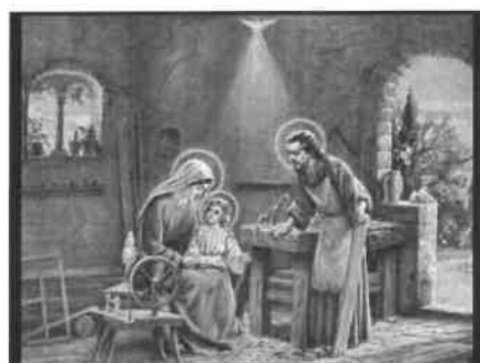
February – Month of the Holy Family