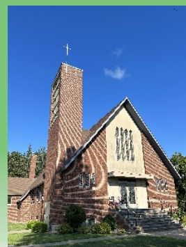
Saint Edward Saint Mary Saint Francis of Assisi